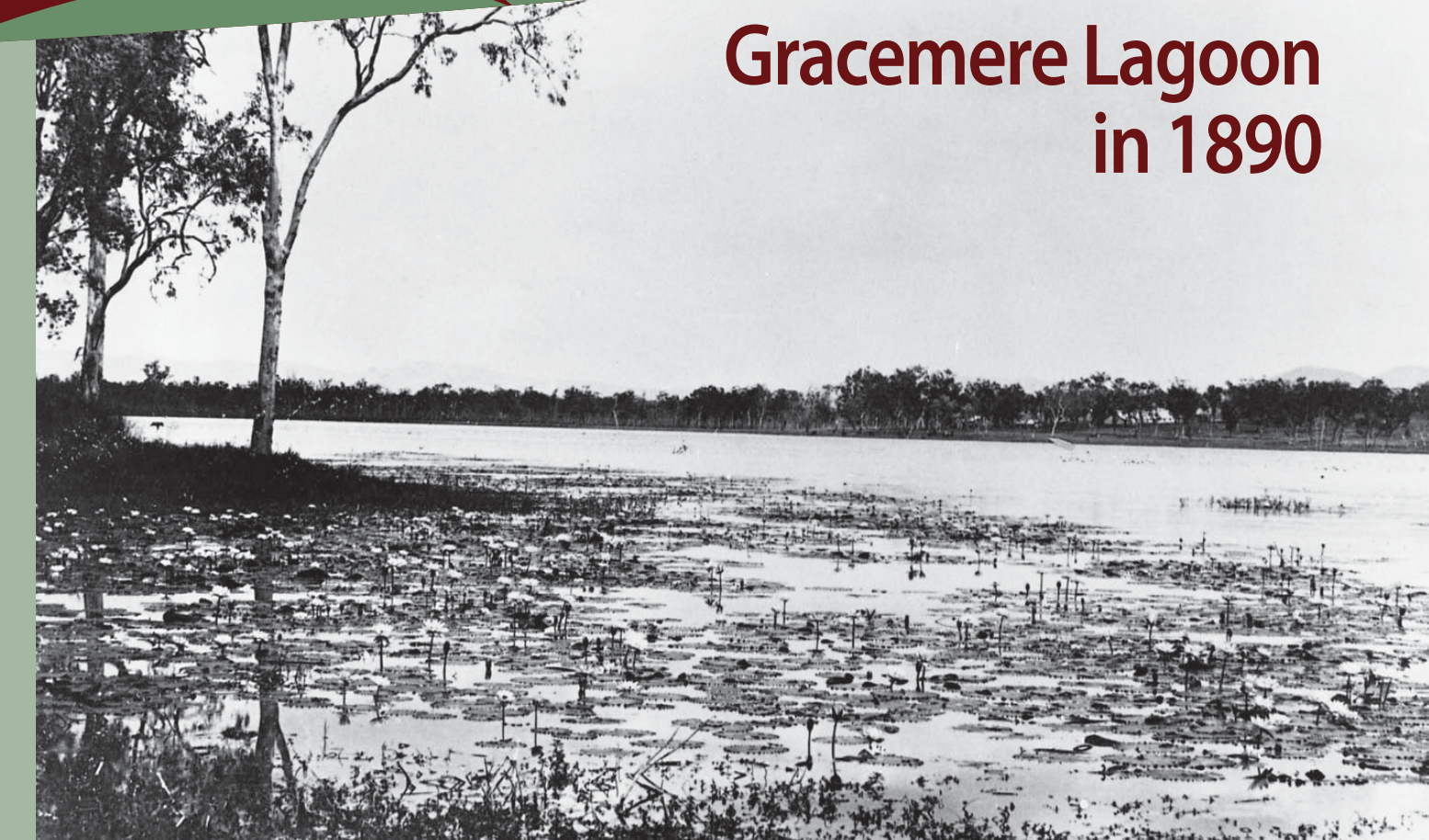
Gracemere Lagoon in 1890