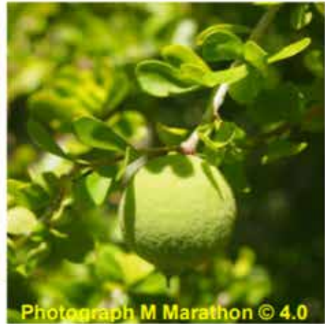
Photograph M Marathon © 4.0